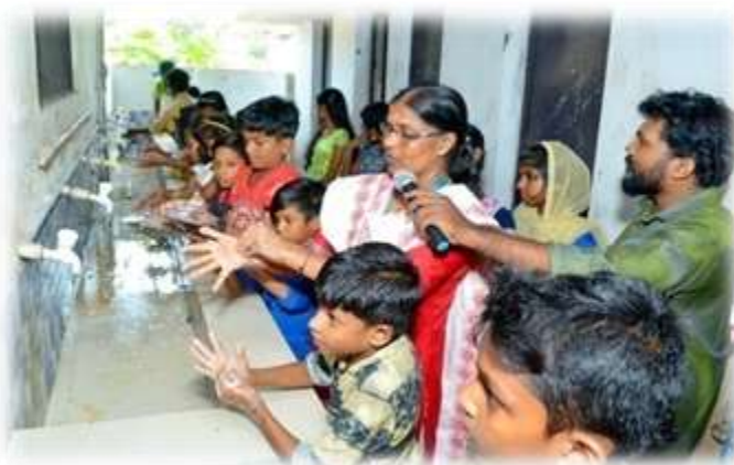
Children practise sanitation at a WaSH event in North Paravur, 7 th May 2019

Now these new structures are being tested by their first monsoon season, which began early this month.