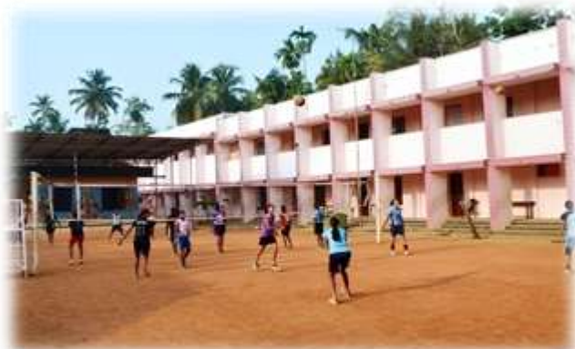
Children play volleyball at Chennamangalam Grama Panchayat Post Traumatic Stress Management Camp, 11/04/2019

Cultural Academy for Peace is aware that despite Kerala's timely and inventive response to tragedy, rebuilding remains a monumental task. That's why we've built income generation into our recovery plan.