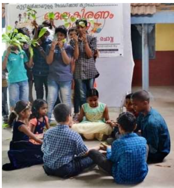
Children's Camp at Paravur Municipality, 7 th March 2019

Cultural Academy for Peace is aware that despite Kerala's timely and inventive response to tragedy, rebuilding remains a monumental task. That's why we've built income generation into our recovery plan.