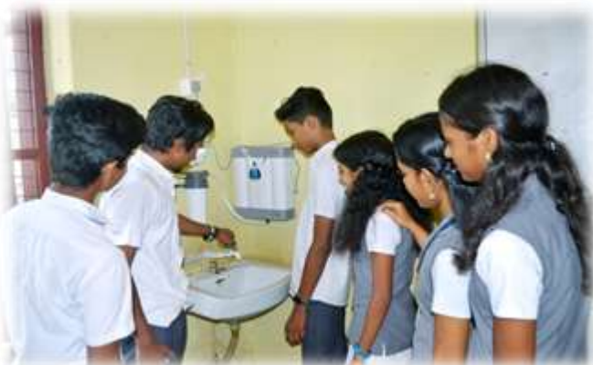
Water filter installation at North Paravur municipal area

Wellbeing camps on the topic of Post Traumatic Stress management (PTSM) for children affected by the floods were also held. A total of 345 youngsters participated.